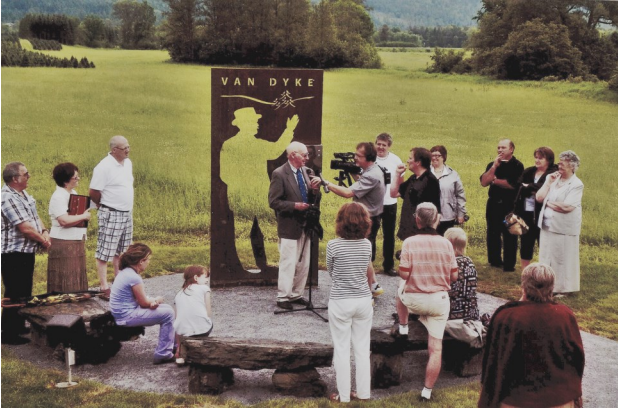
AN INVITATION FROM THE TABLE DE CONCERTATION CULTURELLE DE LA MRC DE COATICOOK (TCCC), THE MUNICIPALITY OF EAST HEREFORD, AND FORÊT HEREFORD